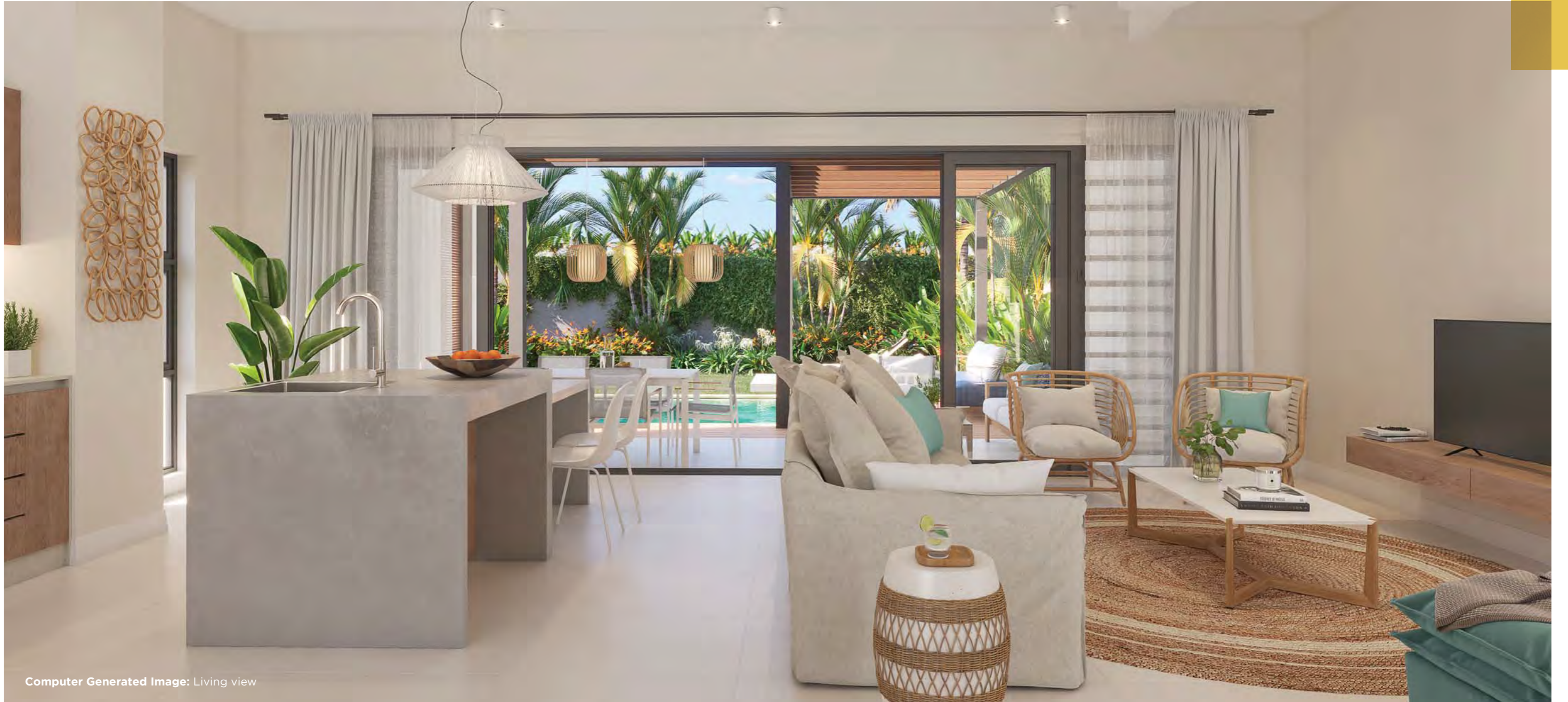
Computer Generated Image: Living view