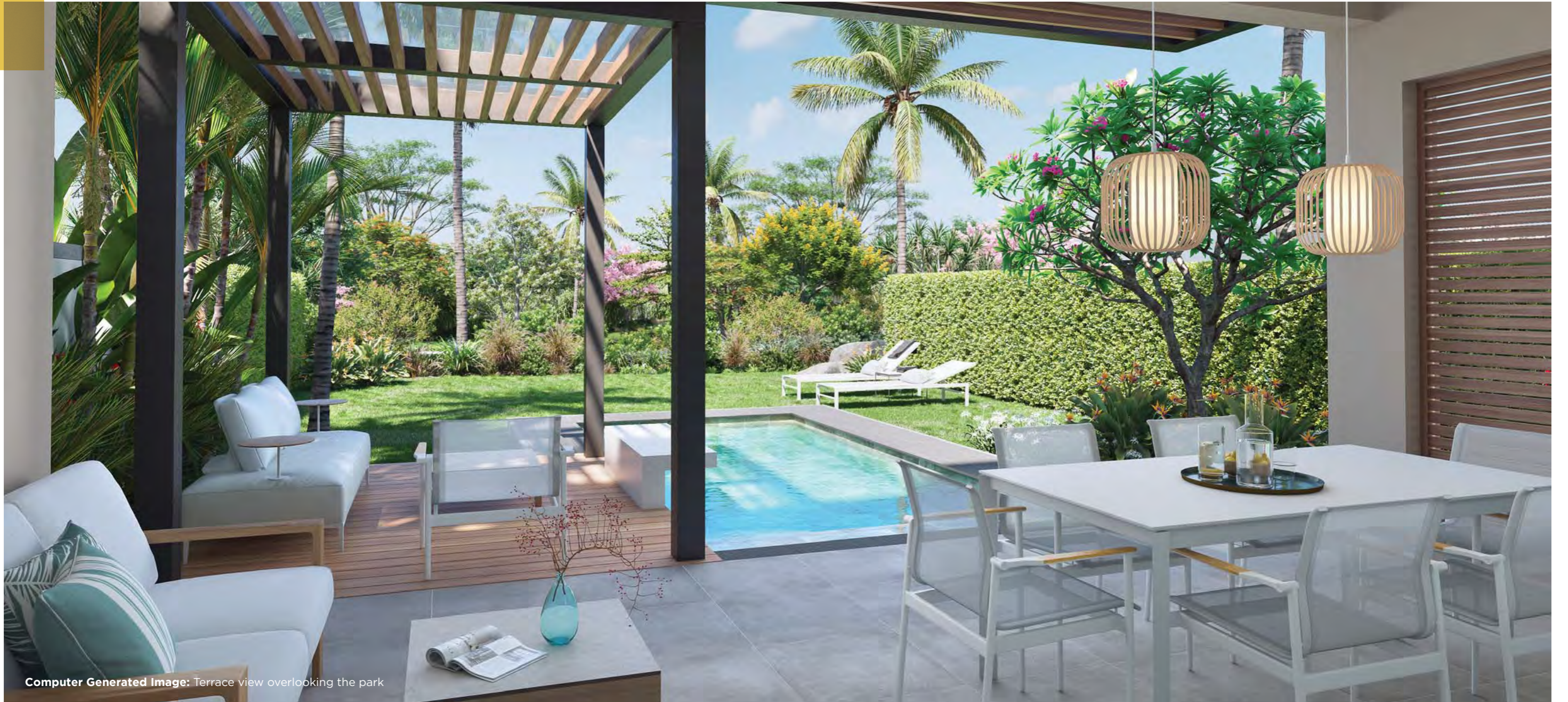
Computer Generated Image: Terrace view overlooking the park