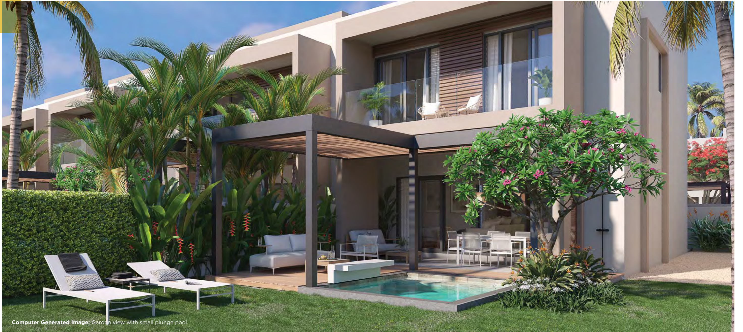
Computer Generated Image: Garden view with small plunge pool