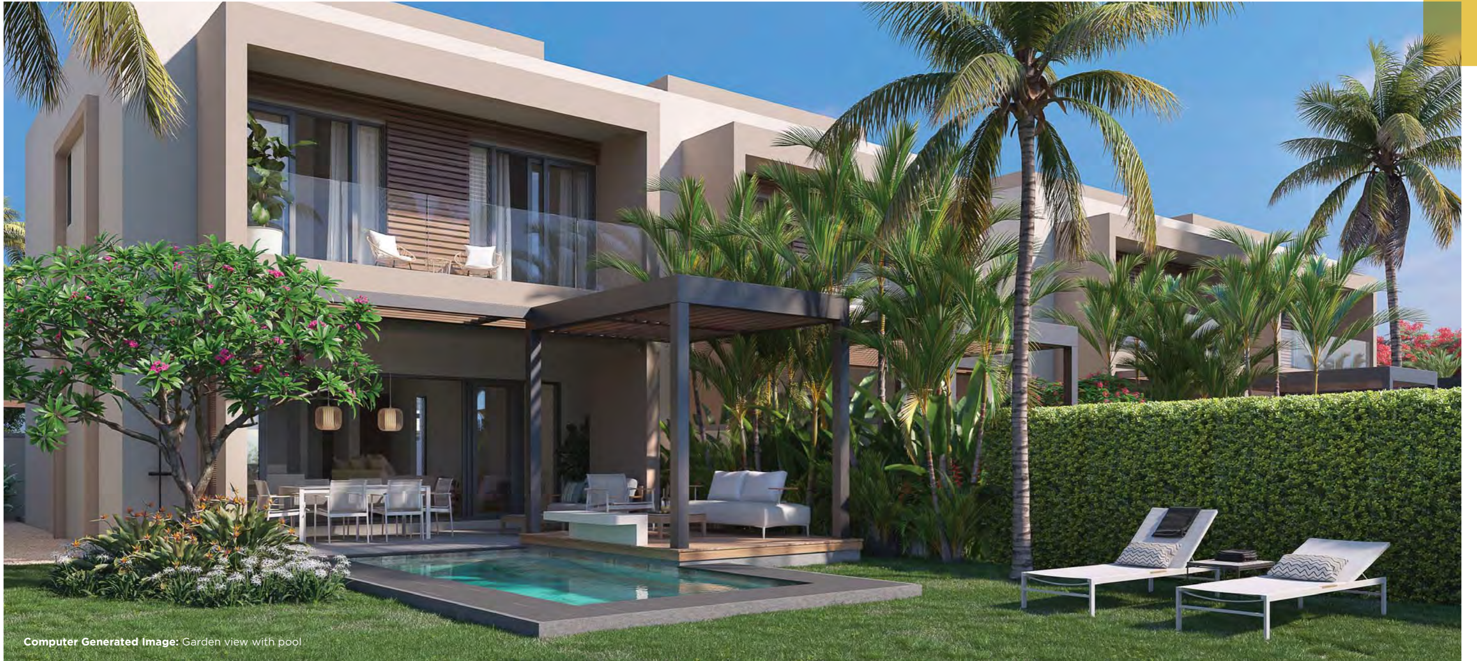
Computer Generated Image: Garden view with pool